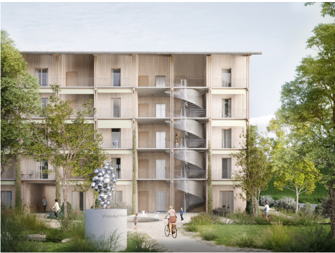
Visualisation: façade, inner courtyard, interior view of ground floor living space, street side view Plans: Situation plan and floor plan 1st floor

The wooden buildings with their eaves-side pergolas bear a subtle resemblance to the traditional farmhouses of Zurich's wine country. The densely planted open space along Zürcherstrasse provides residents with access to the sculptural external staircases that open up the houses and characterise their appearance. Three green courtyards extend between the four terraced buildings, with planting thinning out towards the south.